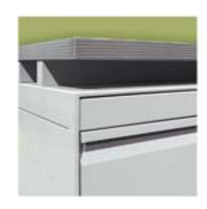
Floor pedestals, Tower pedestals, 2-High Lateral and Storage cabinets are designed to support worksurfaces with rectangular beam structure that gives the worktop a floating appearance.