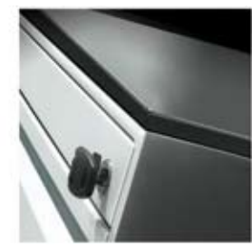
Coloured glass, veneered or melamine-faced worktops are available as options to enhance aesthetics and/or practicality of the storage units.