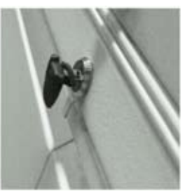
Core-removable locks with flip keys are standard. Available in Key-random or Key-alike options.